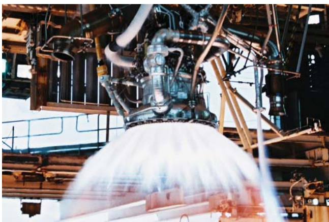
Engine 14001 hot-fire test at Stennis Space Center, MS.