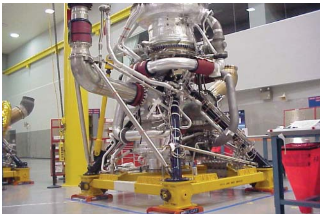
RS-68A Development Engine 14001 assembled at SSC.