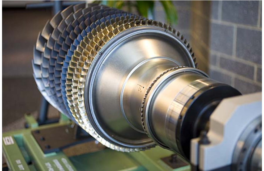
PW800 core following build, on display in East Hartford, CT

This milestone represents a significant step forward in the PW1000G program. Combined with the engine demonstrator test results from last year, the core test results will enable P&W to paint a complete picture of the PW1000G engine and its performance, several years in advance of 2013 Entry into Service. This test will validate the hard work that has been done over the past several years and at the same time give P&W the opportunity to make any changes in design now if the testing indicates a need.