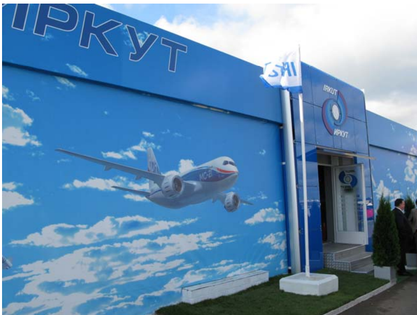
The MC-21 aircraft prominently displayed at the entrance of the Irkut chalet at the 2009 Moscow Air Show

Pratt & Whitney's PurePower PW1000G engine has been chosen by Russia's United Aircraft Corporation as a finalist to power the Irkut MC-21 aircraft. Pratt & Whitney issued the following statement: